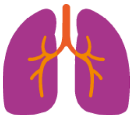
Breathlessness on exertion

Peripartum Cardiomyopathy (PPCM) is a rare form of heart muscle disease which occurs in pregnancy or following birth in women with no previously known heart problems. PPCM symptoms can be confused with normal pregnancy symptoms but are more severe and persistent.