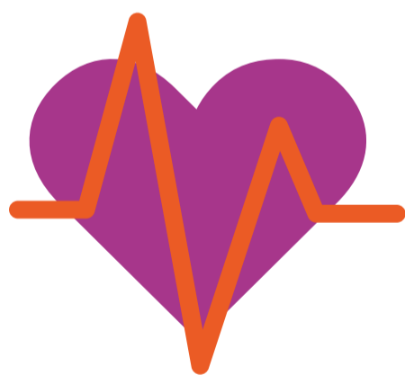
Persistent fast heart rate