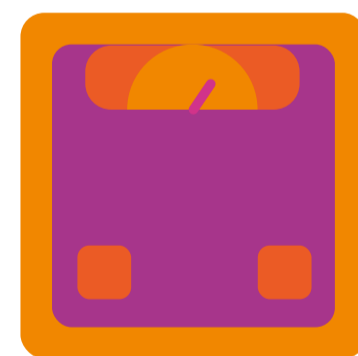
Sudden and significant weight gain

If you have these symptoms, please talk to your midwife or doctor