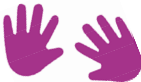
Significant swelling of feet, ankles and hands