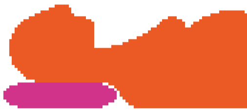
Difficulty breathing when lying flat